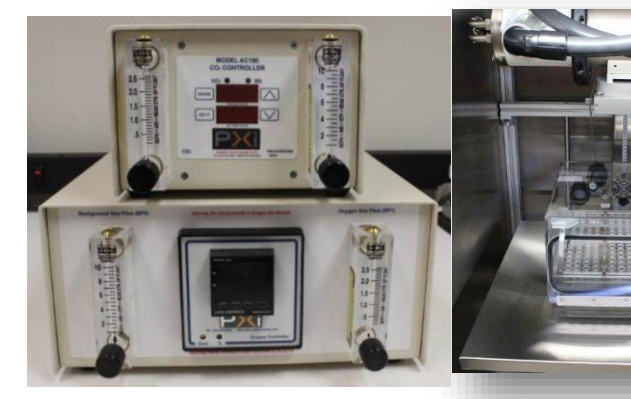
Environmental Chamber Control Environmental Chamber